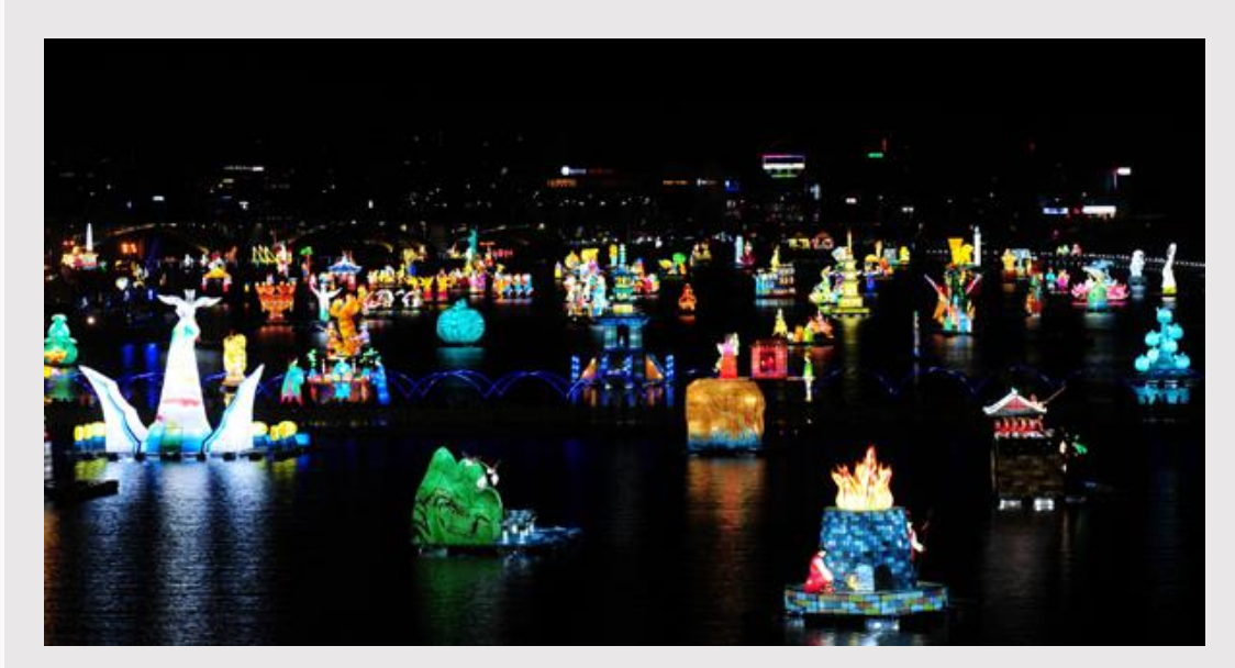
The City of Jinju, S.Korea

The LUCI Newsflash is sent out every month to LUCI members. If you have any news to share with the network, send an email to <a href="mailto:luci@luciassociation.org">luci@luciassociation.org</a>.