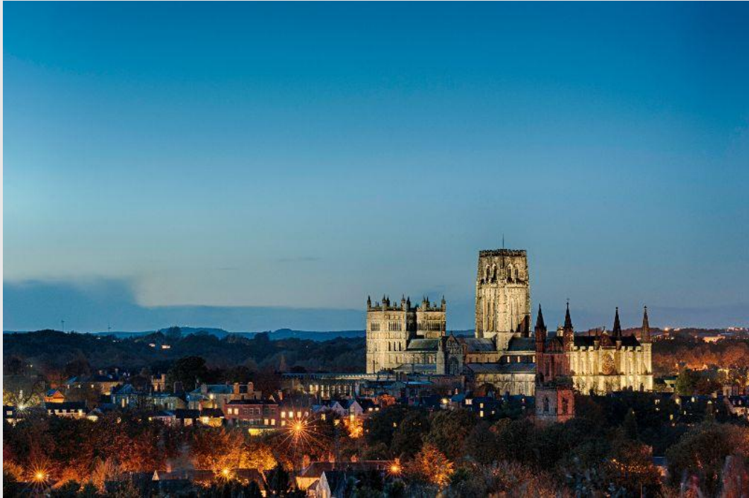
The City of Durham (UK)

The LUCI Newsflash is sent out every month to LUCI members. If you have any news to share with the network, send an email to luci@luciassociation.org .