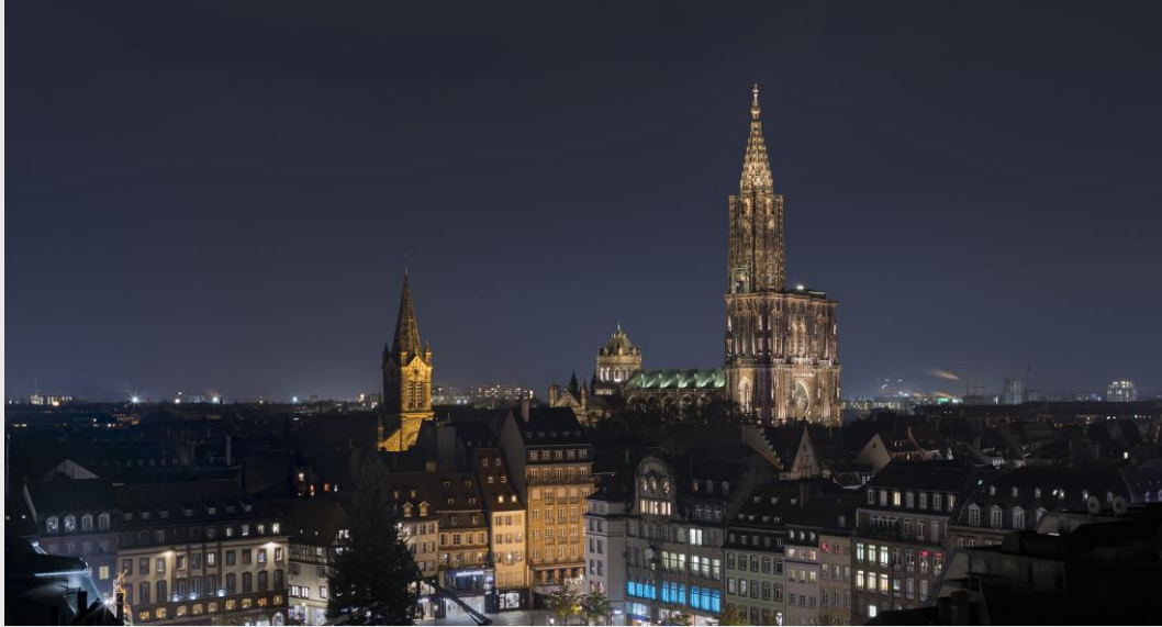
The City of Strasbourg (France)

The LUCI Newsflash is sent out every month to LUCI members. If you have any news to share with the network, send an email to luci@luciassociation.org .