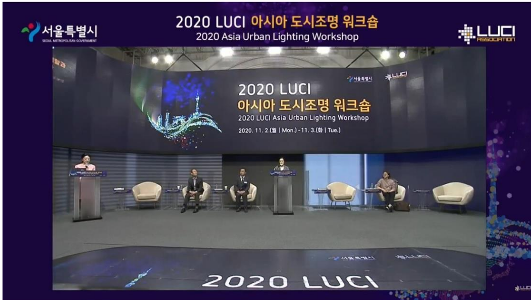
LUCI Asia Urban Lighting Workshop 2020