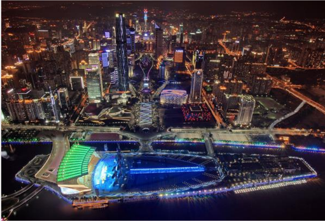
The City of Guangzhou (China)

The LUCI Newsflash is sent out every month to LUCI members. If you have any news to share with the network, send an email to luci@luciasociation.org .