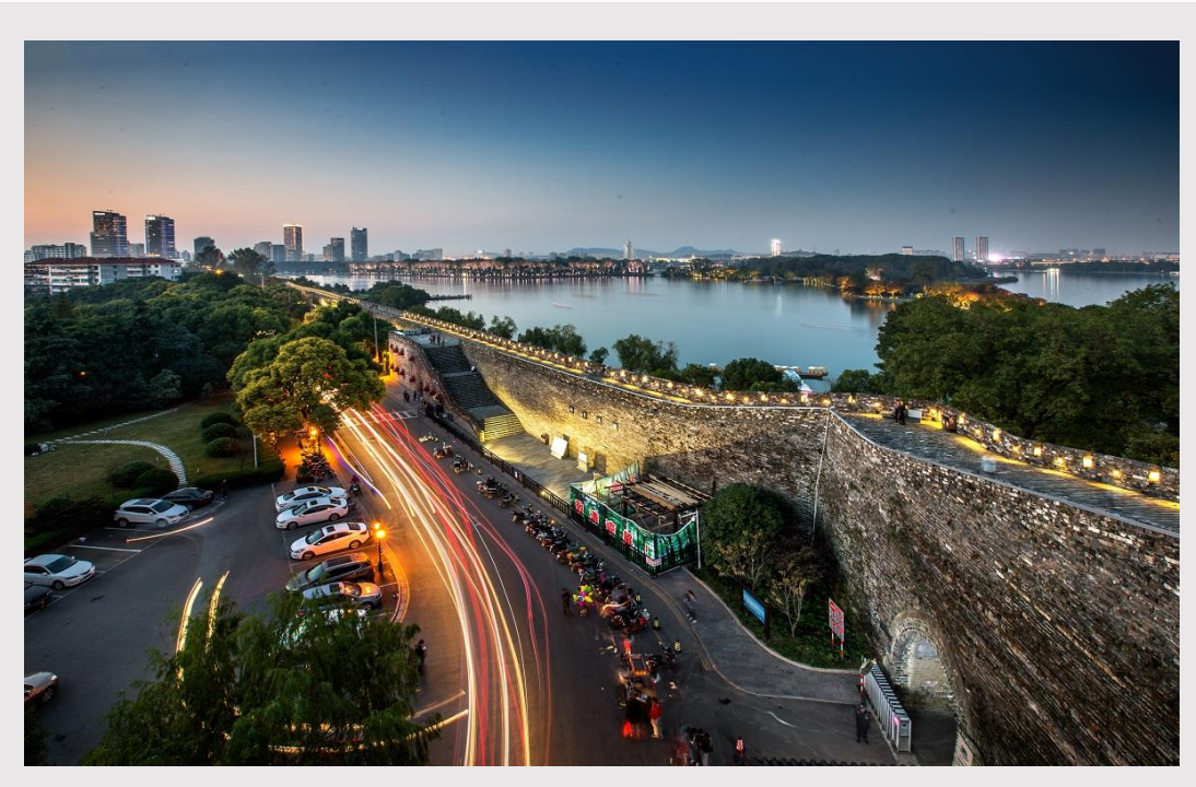
The City of Nanjing (China)

The LUCI Newsflash is sent out every month to LUCI members. If you have any news to share with the network, send an email to <u>luci@luciassociation.org</u>.