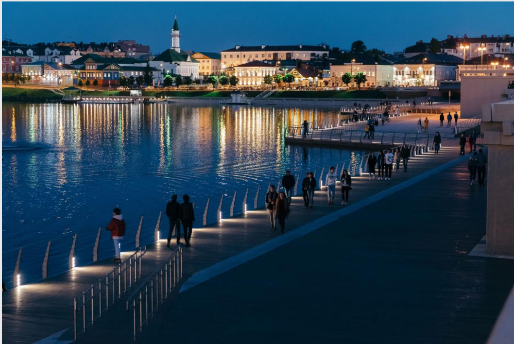
City of Kazan (Russia), new LUCI members in 2021

ACE awards two prizes to LUCI Members "Radiance35" (Outdoor and landscape Lighting design) and "Les éclaireurs" (architectural lighting design). Congratulations to them! See article (in French) here >>