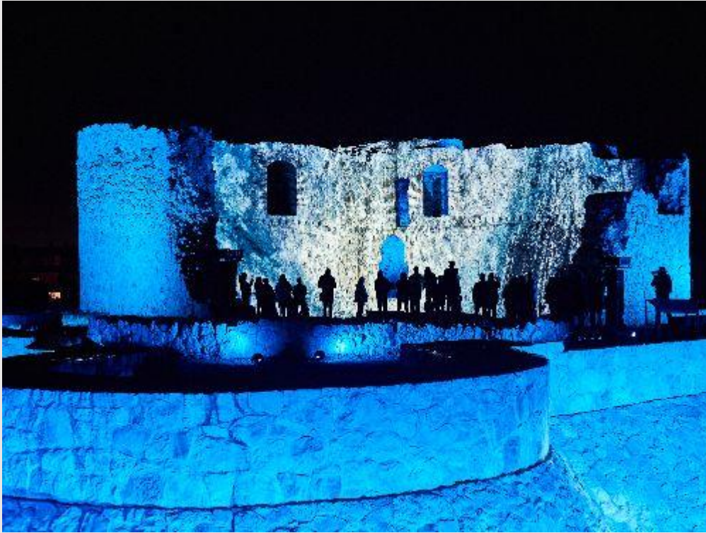
LuzMadrid light festival, City of Madrid (Spain), new LUCI members in 2021

The LUCI Newsflash is sent out every month to LUCI members. If you have any news to share with the network, send an email to luci@luciassociation.org .